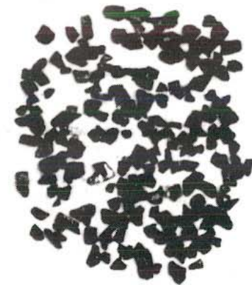
BARLEY \frac{3}{16} \times \frac{3}{32}