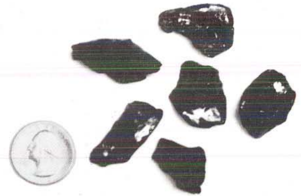
PEA \frac{13}{16} \times \frac{9}{16}