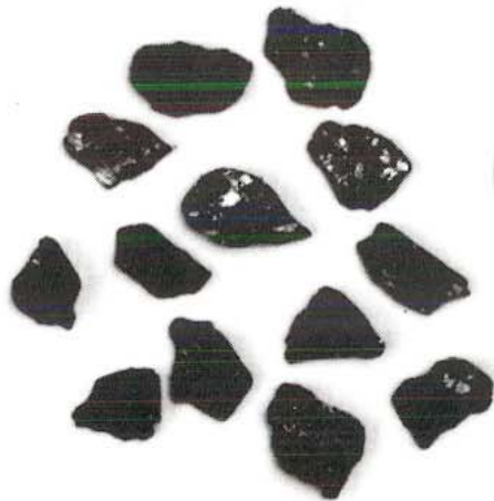
BUCKWHEAT \frac{9}{16} \times \frac{5}{16}