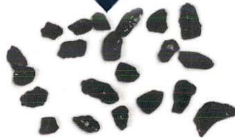
RICE \frac{5}{16} \times \frac{3}{16}