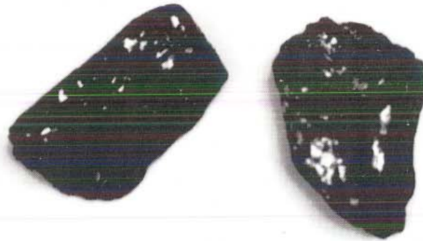
CHESTNUT 1 \frac{5}{8} \times 1 \frac{3}{16}